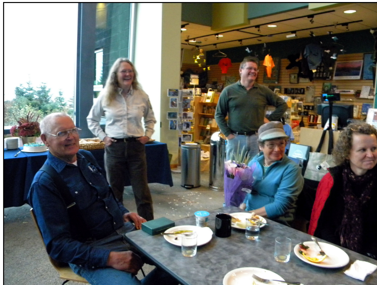
Refuge Week Appreciation Breakfast

An Internet connection is desirable. That requires an Air Card or a Wi-Fi connection, and neither of those work well at the Islands & Ocean Visitor Center.